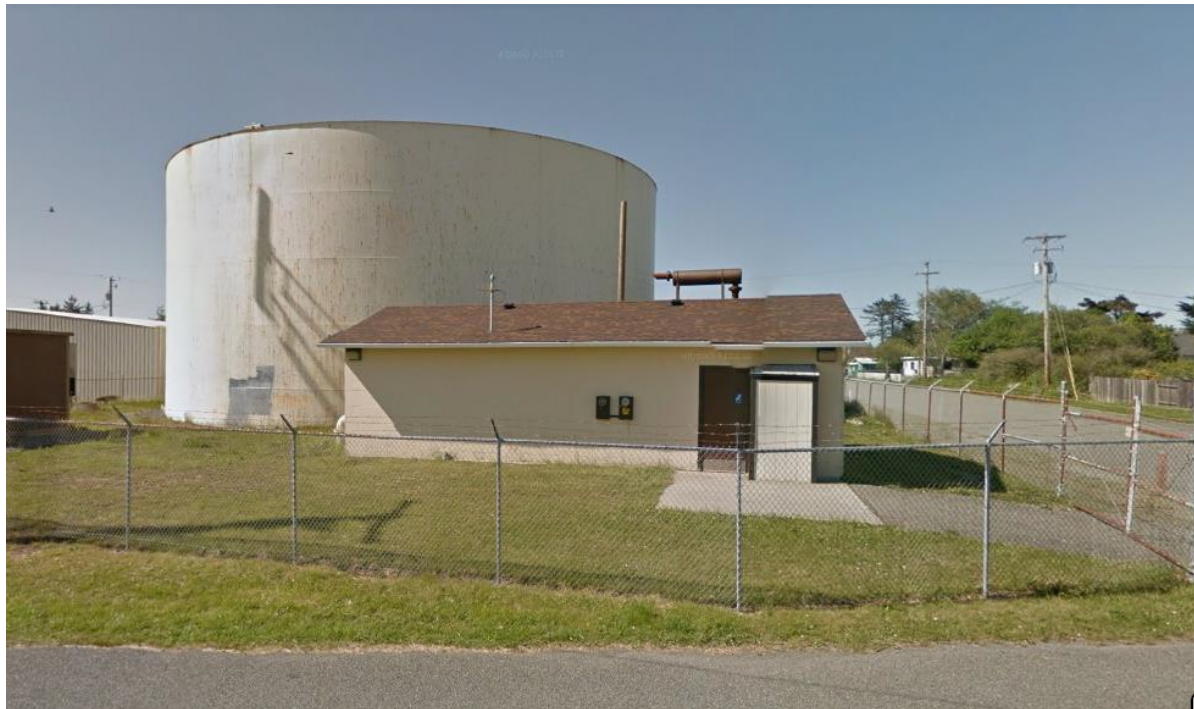
Figure 1- Amador Water Tank