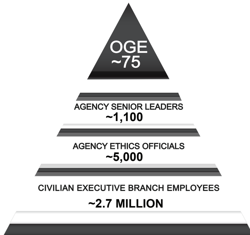
Figure 2: OGE and the Executive Branch

The agency head is also responsible for selecting a Designated Agency Ethics Official (DAEO), the employee with primary responsibility for directing the daily activities of an agency's ethics program and coordinating with OGE. Often, additional professional ethics staff are necessary to effectively carry out important ethics program responsibilities. Each agency's employees, supervisors, human resources officials, and Inspectors General also play a significant role in maintaining the integrity of Government programs and operations.