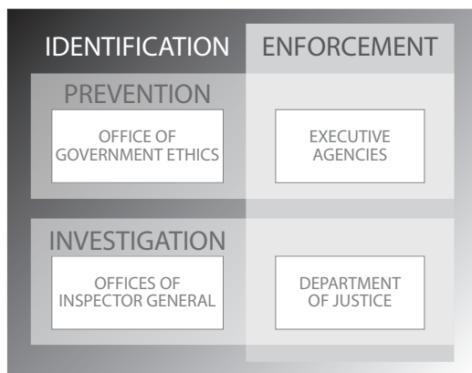
Figure 1: Institutional Integrity

The Ethics in Government Act charges OGE with leading the effort to prevent conflicts of interest in the executive branch. OGE undertakes this important prevention mission as part of a framework comprising