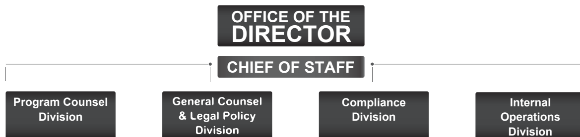
Figure 3: OGE Organizational Chart

OGE's greatest resource is its multidisciplinary staff of attorneys, ethics and financial experts, and other key personnel. OGE is a lean organization, operating at fewer than its 80 authorized full-time equivalents. OGE is led by a Director who is appointed to a five-year term by the President and confirmed by the Senate. As shown in the organizational chart, in addition to the Office of the Director, OGE is divided into four divisions that work together to carry out OGE's mission.